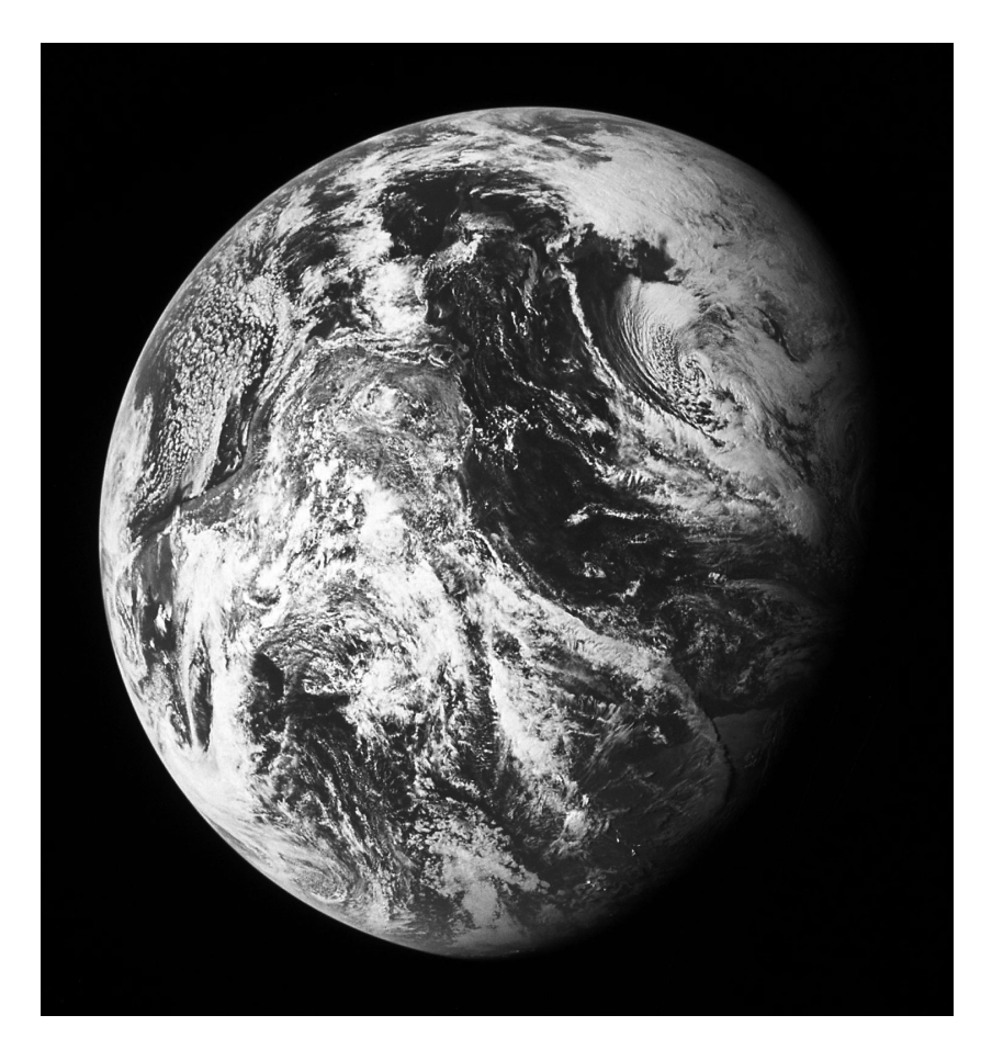
Figure 1.1 Photograph of Earth taken from Apollo 8, December 1968.

of maps, parlor globes, or pre-Darwinian cosmologies. Instead, it meant grasping the planet as a dynamic system: intricately interconnected, articulated, evolving, but ultimately fragile and vulnerable. Network, rather than hierarchy; complex, interlocking feedbacks, rather than central control; ecology, rather than resource: these are the watchwords of the new habit of mind that took Earth's image for its emblem.