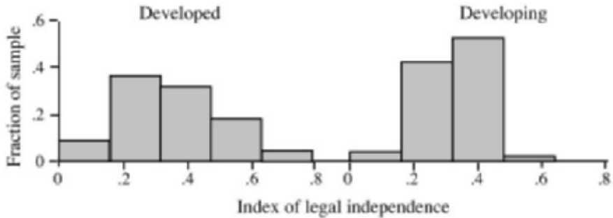
FIGURE 1. Distribution of legal indices of central bank independence in developed and developing countries