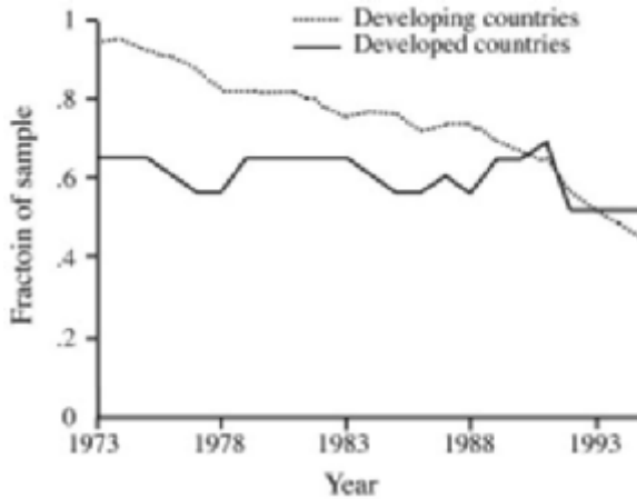
FIGURE 3. Percentage of countries adhering to fixed exchange rates