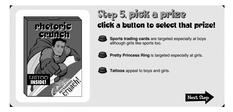
Figure 1.2 PBS's Freaky Flakes offers a simple representation of practices of children's advertising.

The argument Freaky Flakes mounts is more procedural than Retouch , but only incrementally so. The user recombines elements to configure a cereal box, but he chooses from a very small selection of individual configurations. Freaky Flakes is designed for younger users than Retouch , but the children who watch PBS Kids also likely play videogames much more complex than this simple program. Most importantly, Freaky Flakes fails to integrate the process of designing a cereal box with the supermarket where children might actually encounter it. The persuasion in Retouch reaches its apogee when the user sees the already attractive girl in the fake magazine ad turned into a spectacularly beautiful one. This gesture is a kind of visual enthymeme, in which the