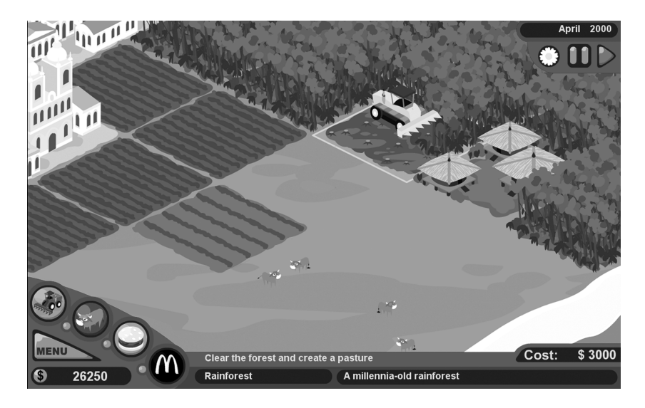
Figure 1.1 In Molleindustria's The McDonald's Game , players must use questionable business practices to increase profits.

grazing (see figure 1.1). These tactics correspond with the questionable business practices the developers want to critique. To enforce the corrupt nature of these tactics, public interest groups can censure or sue the player for violations. For example, bulldozing indigenous rainforest settlements yields complaints from antiglobalization groups. Overusing fields reduces their effectiveness as soil or pasture; creating dead earth also angers environmentalists. However, those groups can be managed through PR and lobbying in the corporate sector. Corrupting a climatologist may dig into profits, but it ensures fewer complaints in the future. Regular subornation of this kind is required to maintain allegiance. Likewise, in the slaughterhouse players can use growth hormones to fatten cows faster, and they can choose whether to kill diseased cows or let them go through the slaughter process. Removing cattle from the production process reduces material product, thereby reducing supply and thereby again reducing profit. Growth hormones offend health critics, but they also allow the rapid production necessary to meet demand in the restaurant sector. Feeding cattle animal by-products cheapens the fattening process, but is more likely to cause disease. Allowing diseased meat to be made into burgers may spawn complaints and fines from health officers, but those groups too can be bribed through lobbying. The restaurant sector