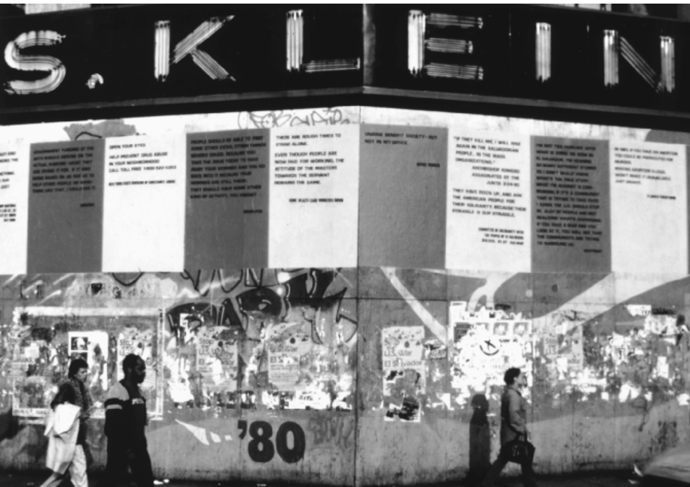
Group Material, DaZiBaos , poster project at Union Square, New York, 1982.