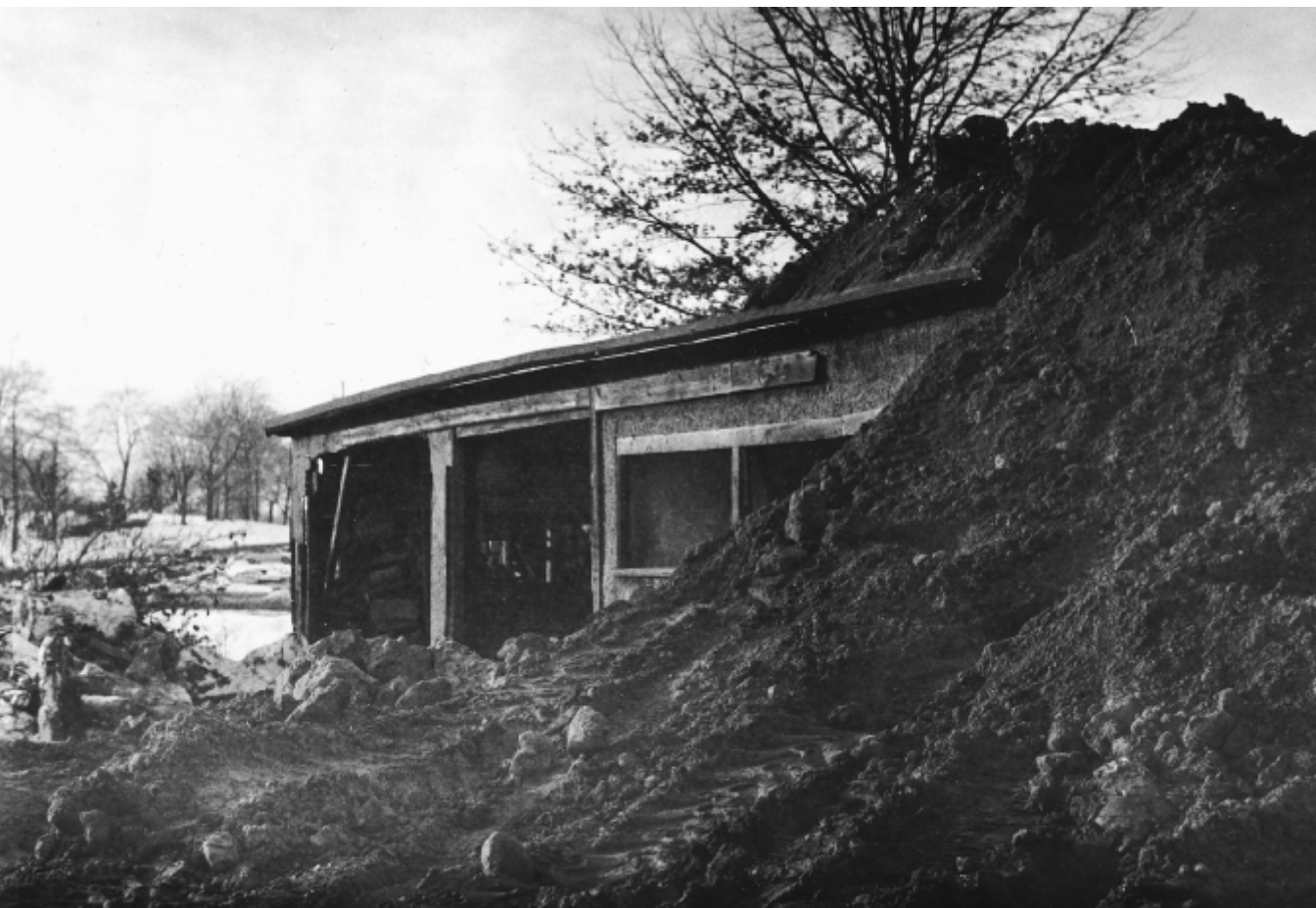
Robert Smithson, Partially Buried Woodshed, at Kent State University campus, 1970.