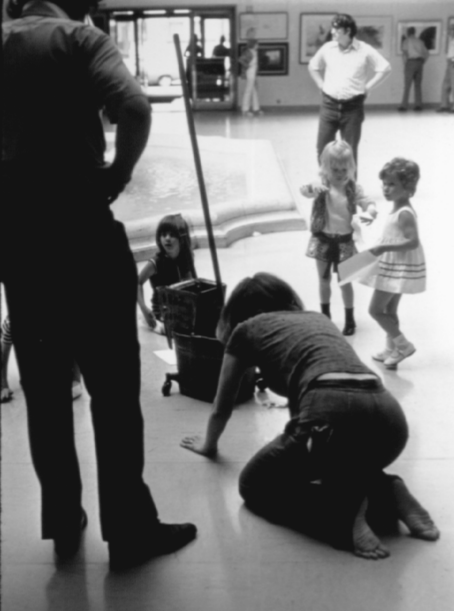
Mierle Laderman Ukeles, Hartford Wash: Washing Tracks, Maintenance Inside, Wadsworth Atheneum, Hartford, 1973.