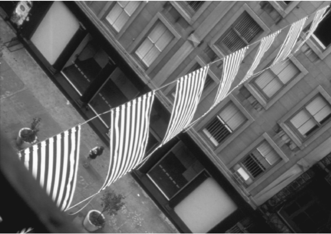
Daniel Buren, photo-souvenir: Within and Beyond the Frame, John Weber Gallery, New York, 1973.