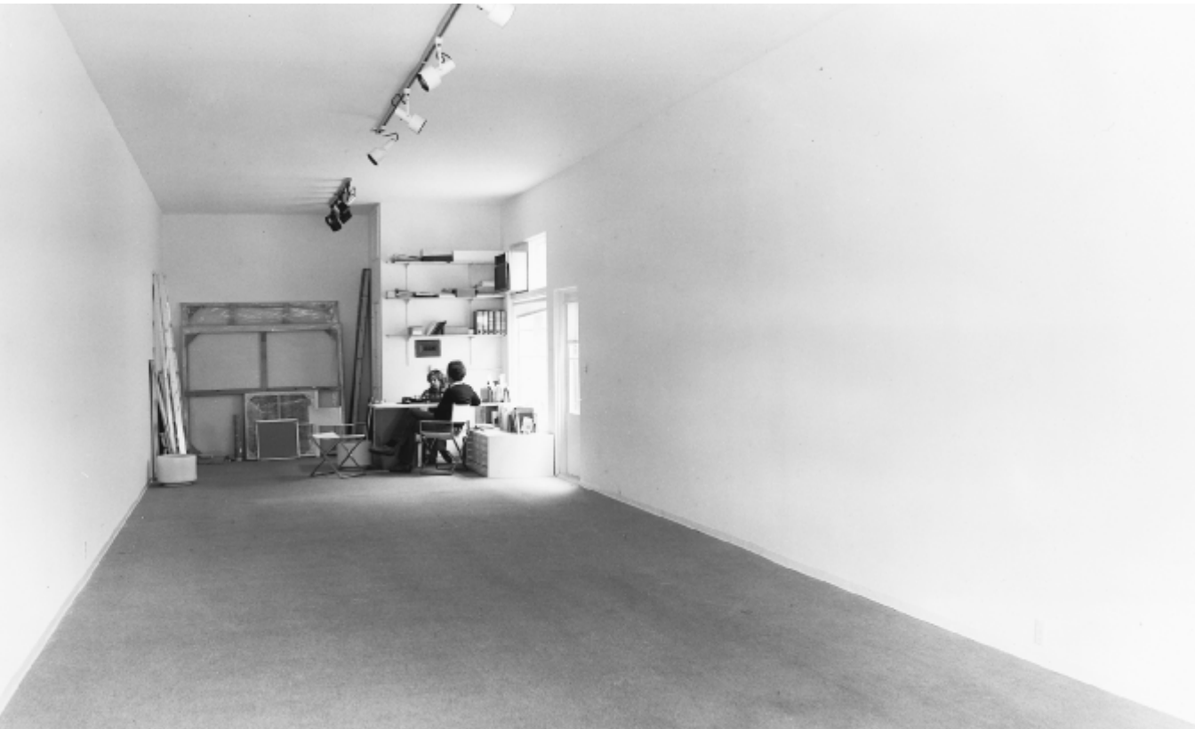
Michael Asher, untitled installation at Claire Copley Gallery, Inc., Los Angeles, 1974.

In the paradigmatic practice of Hans Haacke, for instance, the site shifted