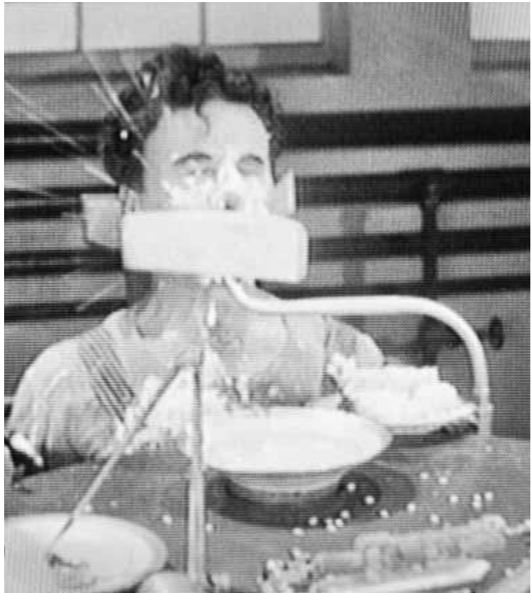
1.5 Charlie Chaplin, Modern Times , 1936; still of broken feeding machine molesting Chaplin.