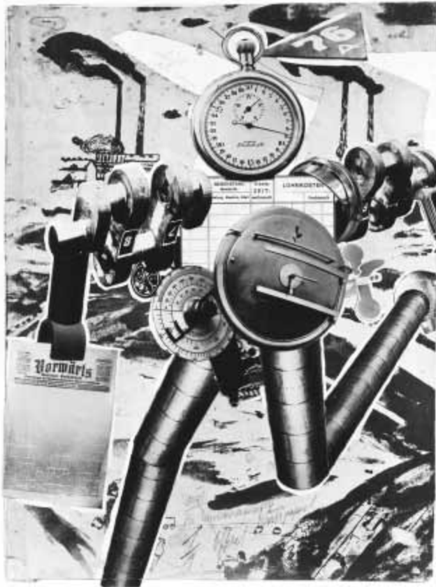
1.3 John Heartfield, Rationalization Marches / A Spectre Goes around Europe , c. 1927, collage; a manipulated version of this was published in Der Knippel , no. 2 (February 1927). Akademie der Künste, Berlin; © 2002 Artists Rights Society (ARS), New York / VG Bild-Kunst, Bonn.