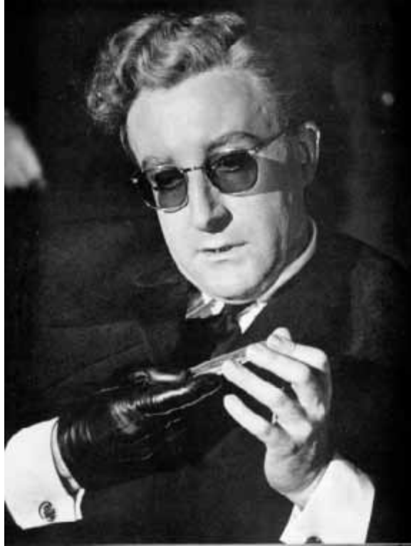
Figure 1.1 Dr. Strangelove.

fairly complicated things, acts we might class as willful and voluntary if we were just watching and hadn't learned of the patient's lamentable loss of control. In the case of another patient, for example, "While playing checkers on one occasion, the left hand made a move he did not wish to make, and he corrected the move with the right hand; however, the left hand, to the patient's frustration, repeated the false move. On other occasions, he turned the pages of the book with one hand while the other tried to close it; he shaved with the right hand while the left one unzipped his jacket; he tried to soap a washcloth while the left hand kept putting the soap back in the dish; and he tried to open a closet with the right hand while the left one closed it" (Banks et al. 1989, 457). By the looks of it, the alien hand is quite willful. On the other hand (as the pun drags on),