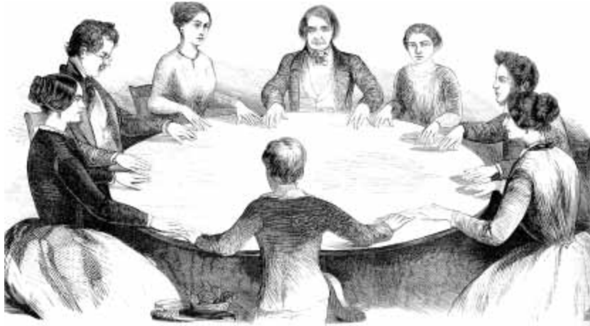
Figure 1.2 A table-turning séance. From L'Illustration (1853).

Another case of the absence of experience of will occurs in table turning , a curious phenomenon discovered in the spiritualist movement in Europe and America in the mid-nineteenth century (Ansfield and Wegner 1996; Carpenter 1888; Pearsall 1972). To create this effect, a group of people sit gathered around a table, all with their hands on its surface. If they are convinced that the table might move as the result of spirit intervention (or if they are even just hoping for such an effect) and sit patiently waiting for such movement, it is often found that the table does start to move after some time (fig. 1.2). It might even move about the room or begin rotating so quickly that the participants can barely keep up. Carpenter (1888, 292–293) observed that “all this is done, not merely without the least consciousness on the part of the performers that they are exercising any force of their own, but for the most part under the full conviction that they are not.”