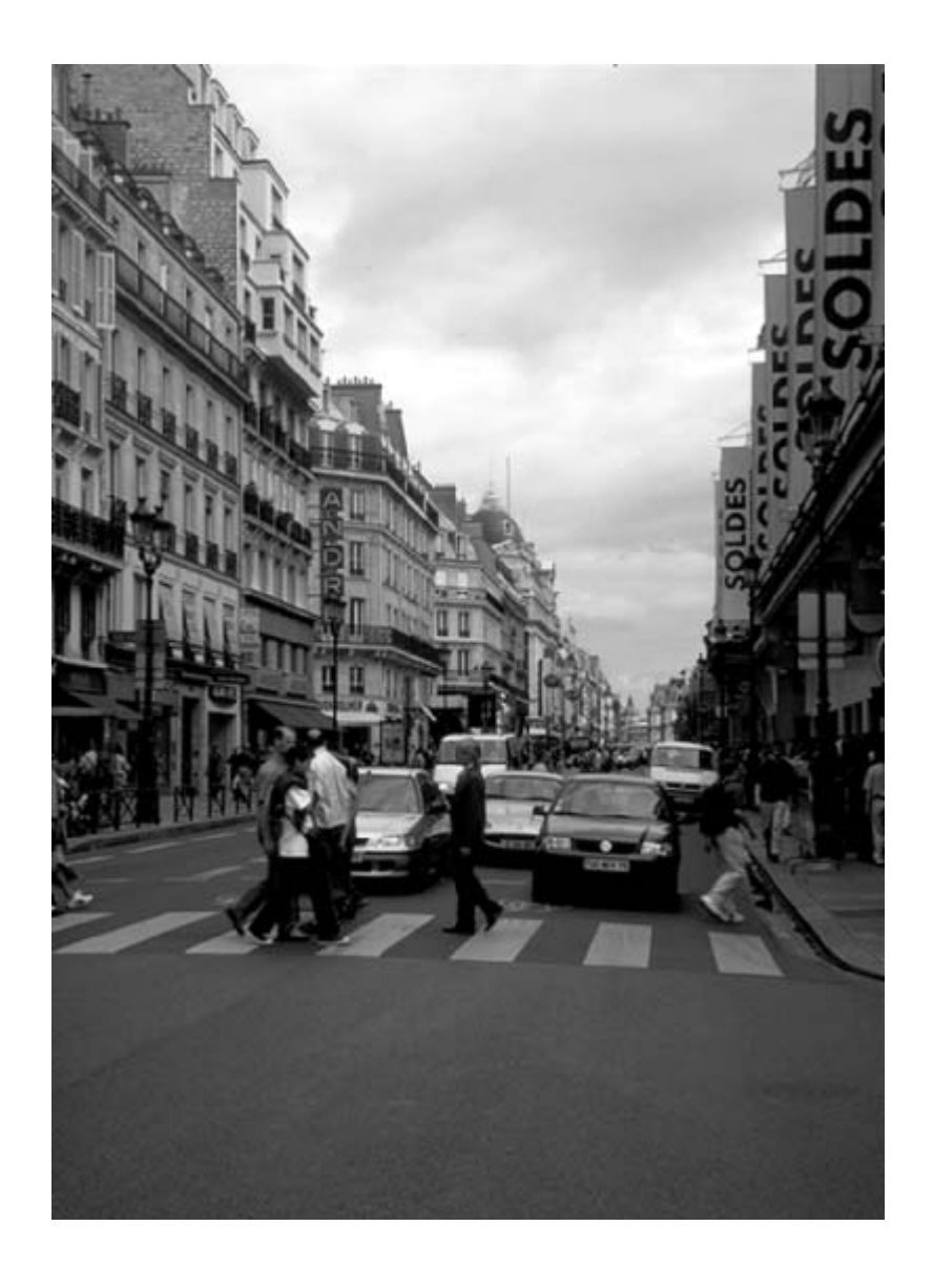
1.8 Rue de Rivoli, looking east, 2000.