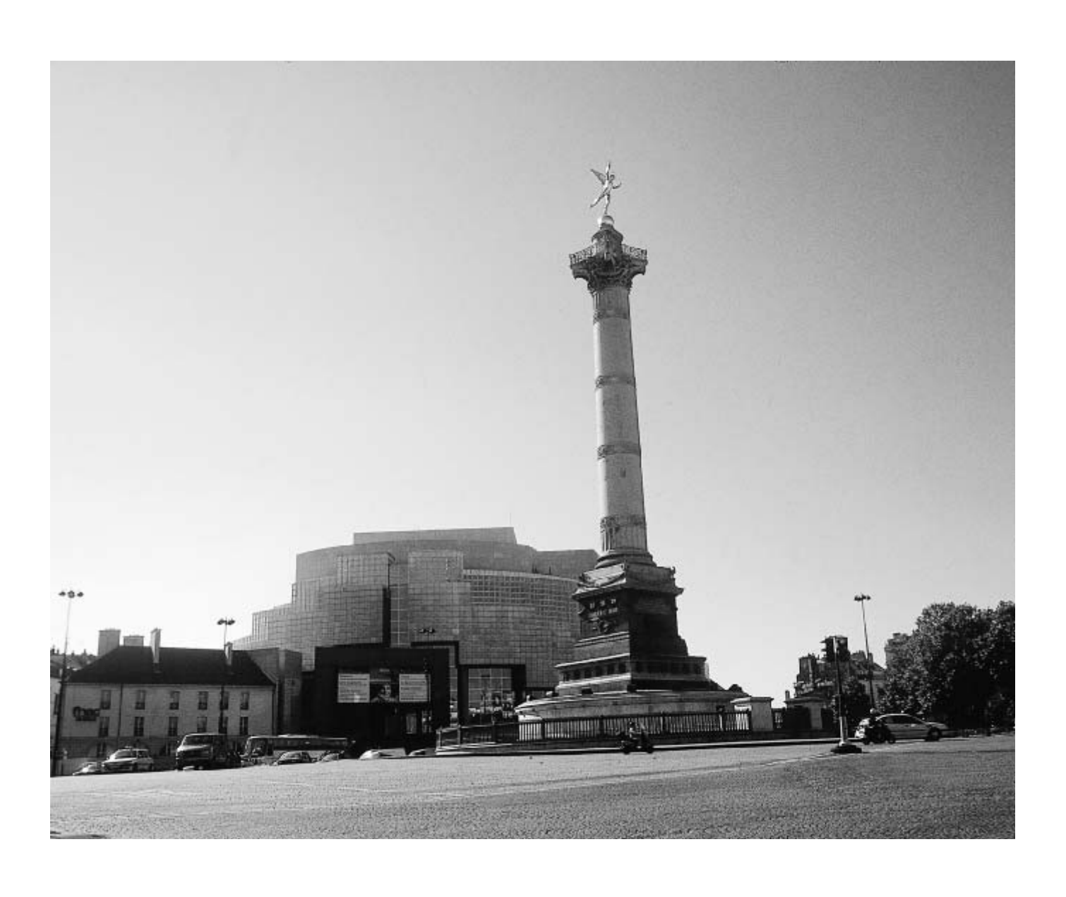
1.4 Place de la Bastille, with Carlos Ott's Opéra de la Bastille, 1989.