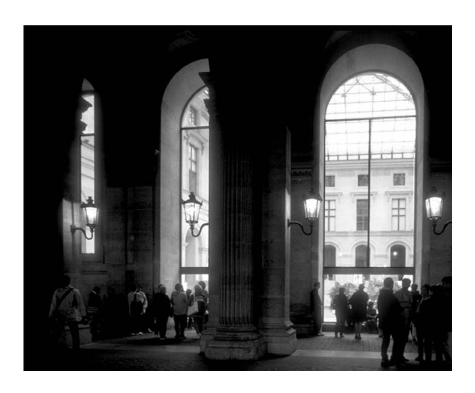
1.12 l. M. Pei and Partners, Passage Richelieu, Musée du Louvre 1992.