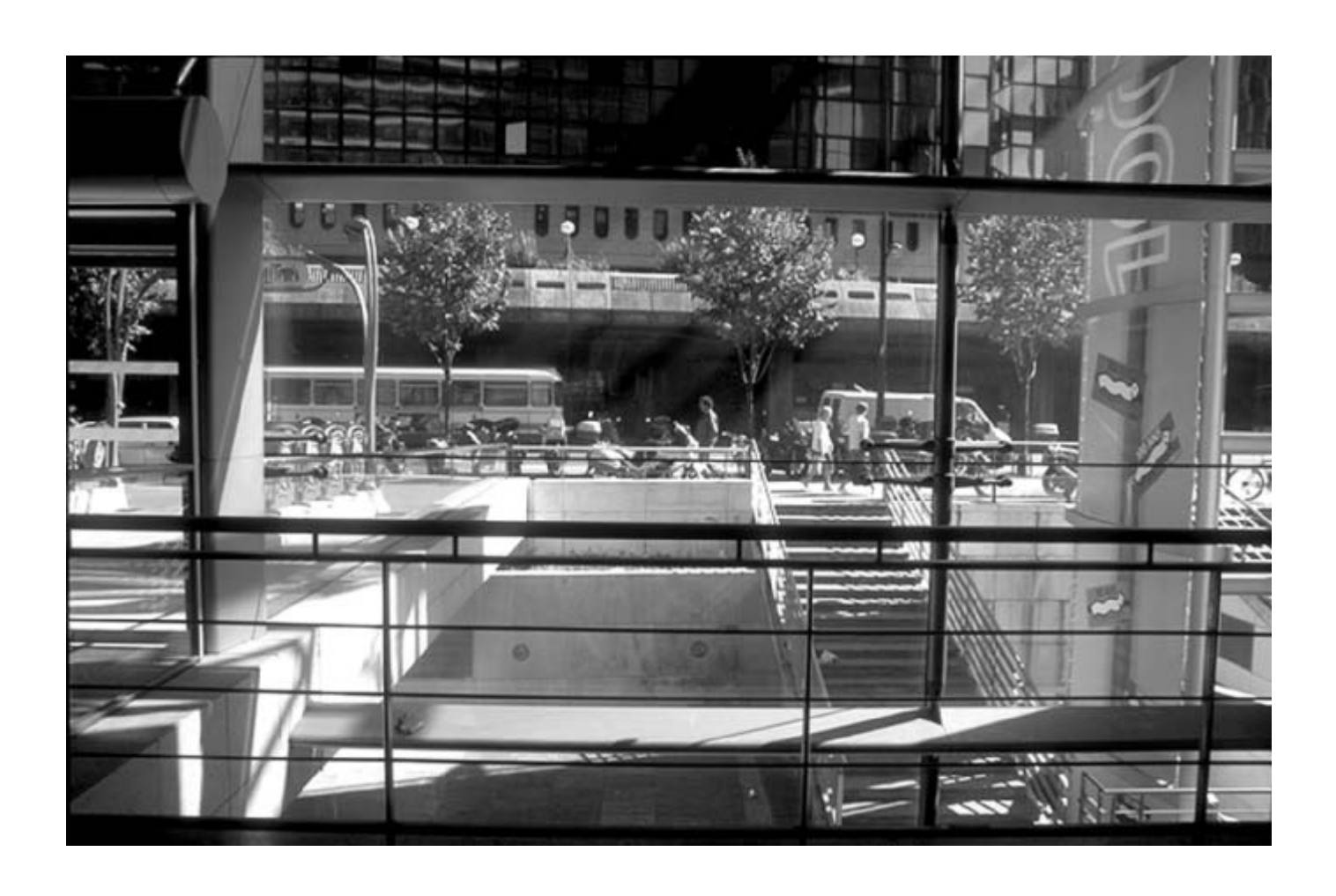
1.10 View from within Sirvin et Associés, the Maison de la RATP, 1996.