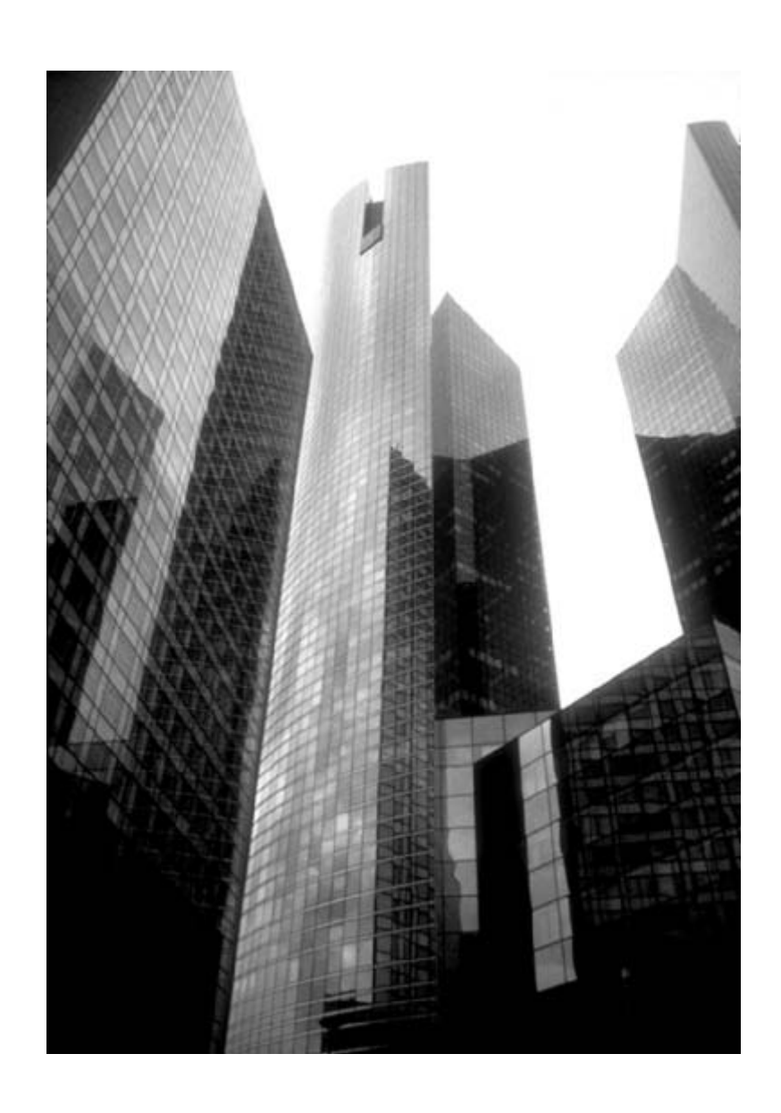
1.9 Tour Société Générale, La Défense. (Architect unknown)