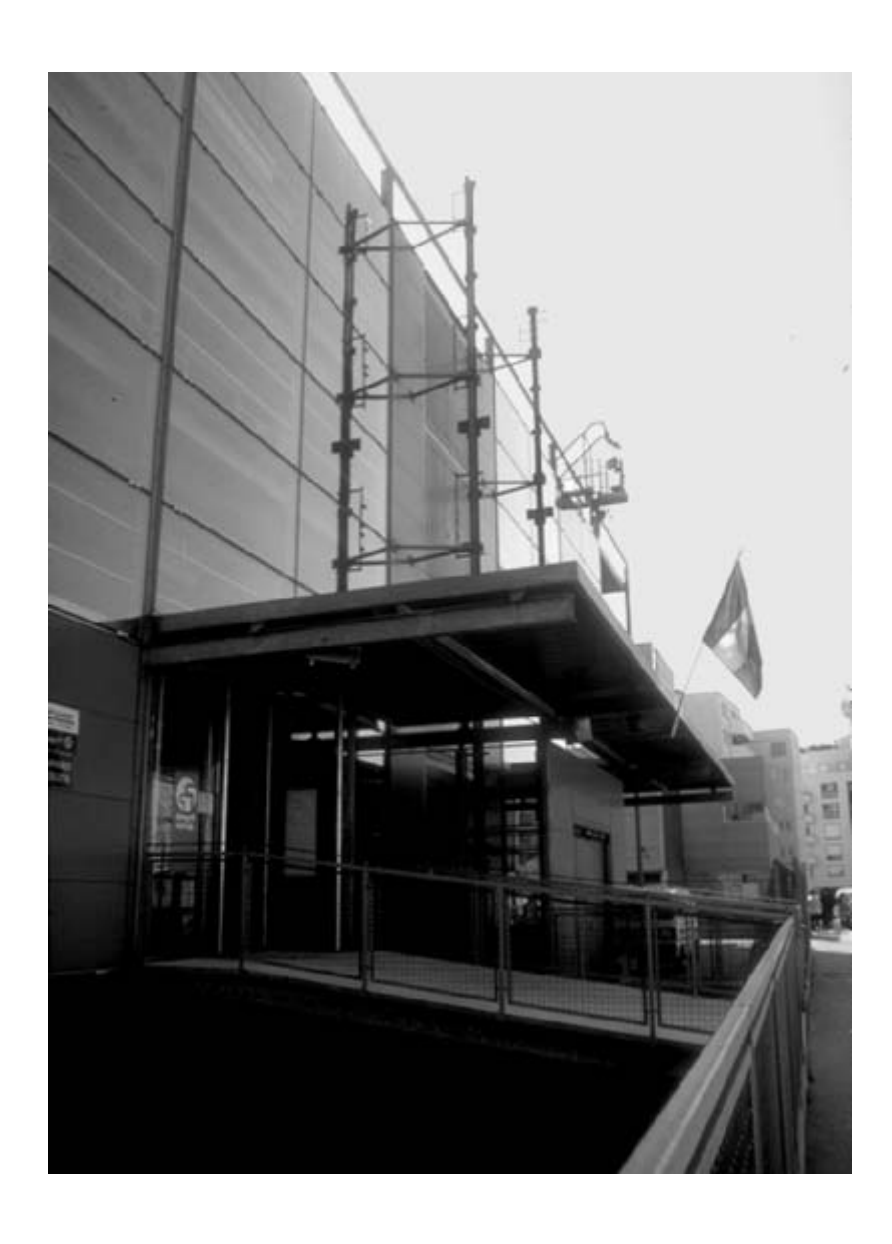
1.14 Renzo Piano, Agence de la Propreté. (City Cleaning Department, 1988)