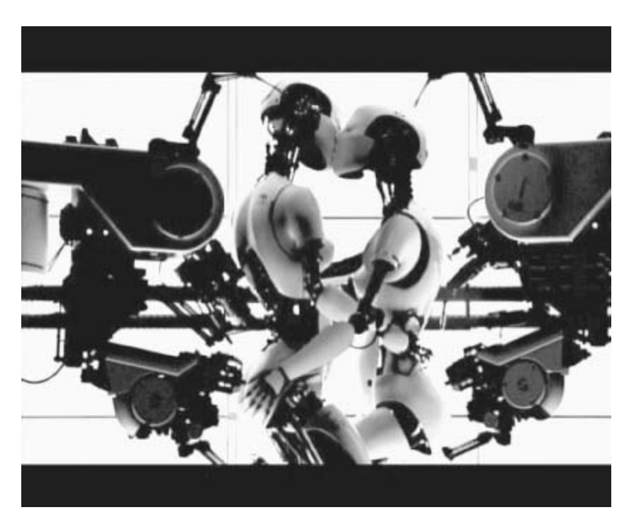
Figure 1.1. Björk. Still of music video, "All is Full of Love," 1999.

in other words, behave humanly, but are themselves built according to the image of the posthuman.<sup>66</sup>