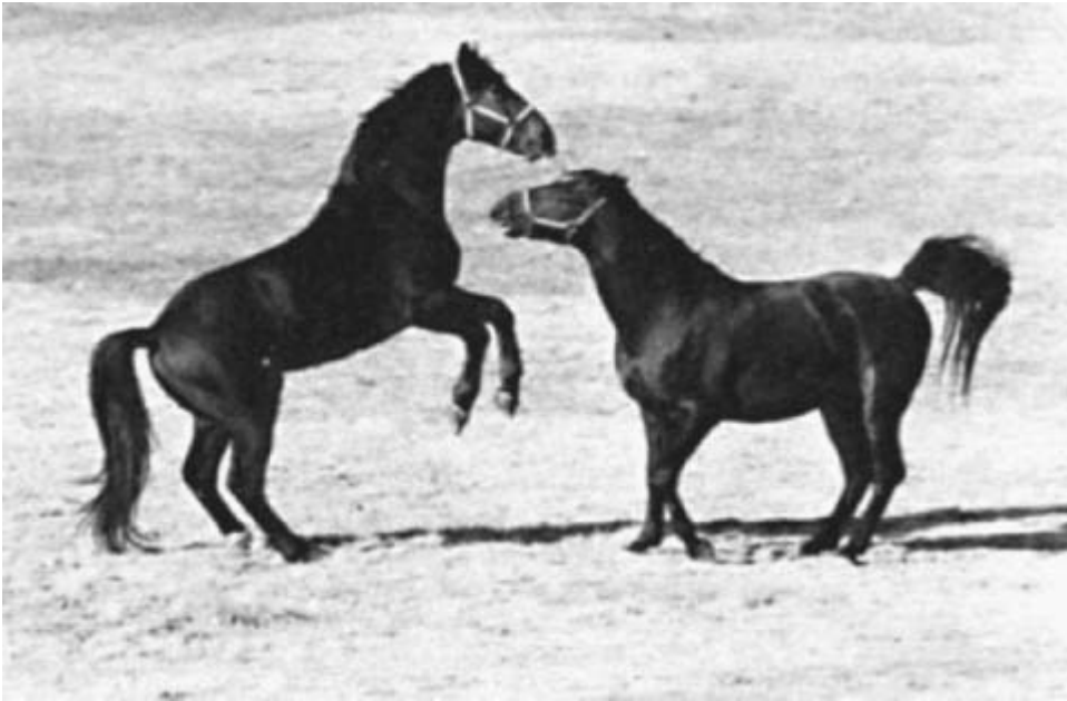
Figure 1.2 Social play in young male horses. (From Waring, 1983)