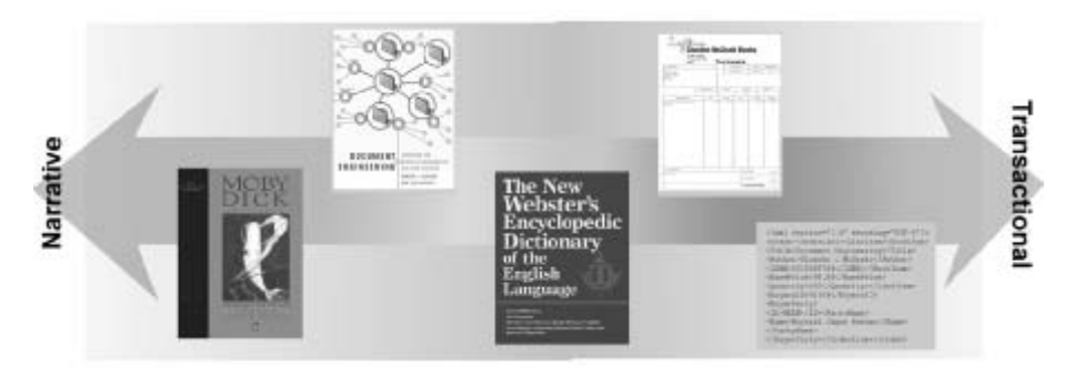
Figure 1-2. The Document Type Spectrum

We view both documents and data on a continuum we call the Document Type Spectrum (see Figure 1-2) by analogy with the continuous rainbow formed by the visible light spectrum. It is easy to contrast highly narrative style documents from those that are highly transactionally oriented, just as it is easy to distinguish red from blue. But it can be difficult to distinguish different shades of a single color.