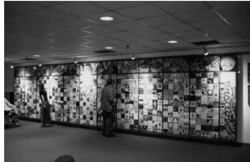
An Introduction to Platforms 5