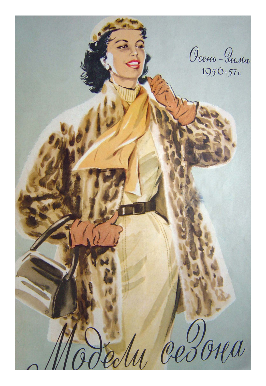
FIGURE 0.5 Fashion drawing, Modeli sezona , Moscow (Autumn-Winter 1956–1957), cover.