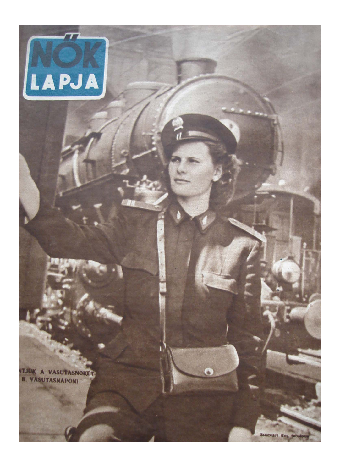
FIGURE 0.2 Nők lapja , Budapest (August 1952), back cover.