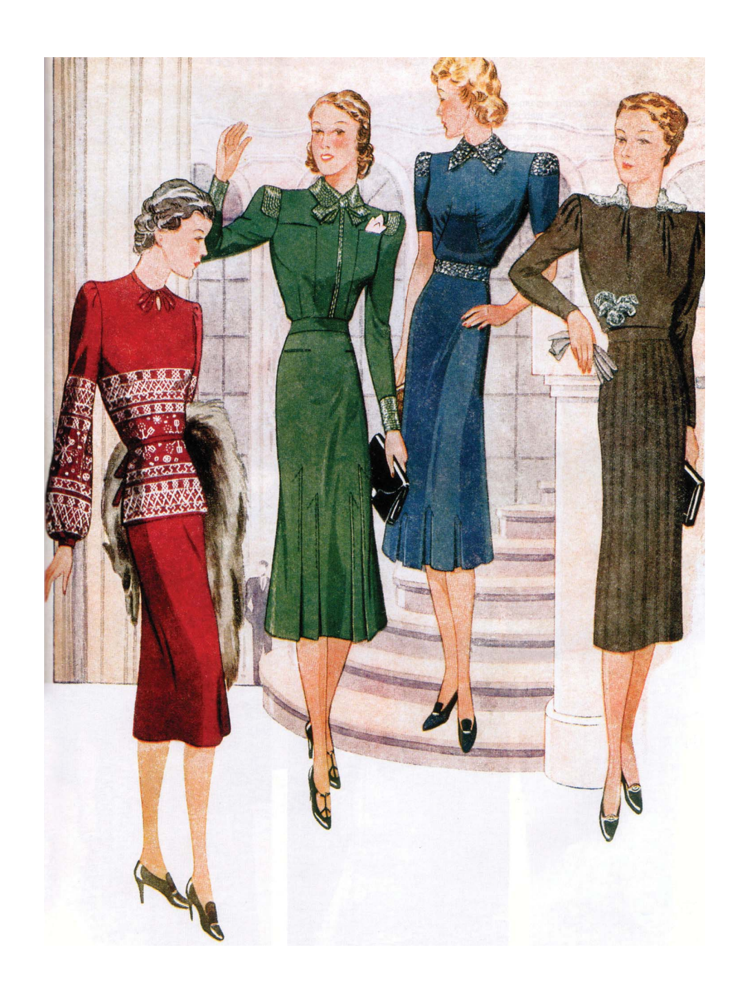
FIGURE 0.3 Fashion drawing, Modeli sezona , Moscow (1939–1940, no. 4).