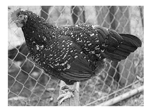
Figure 1.2 A speckled hen.

Ayer (1940) held that, since one is unable to count the experienced speckles accurately, it is a mistake to assert that there is a definite number of speckles one sees. Ayer was not denying, of course, that there is a definite number of speckles on the hen; his view was proposed with respect to what he took to be the immediate object of experience, namely the sense datum presented by the hen. The sense datum has many speckles on it, according to Ayer, but there is no definite answer to the question "How many speckles does it have?" Prima facie , this view is contradictory.